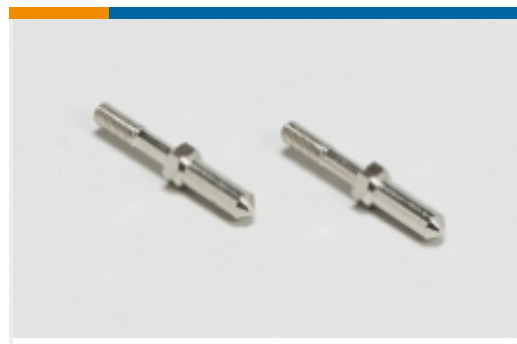
Docking Connector Guide Hardware(5)